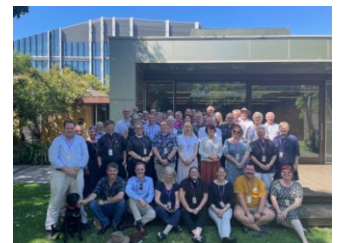
The National Evangelism Workshop for Hope25 in Melbourne

The Task Force and Strategic Planning Facilitator will seek to encourage parishes to particularly focus on developing their personal evangelism skills in the lead up to this campaign so that church members are as effective as possible in Sharing Jesus for Life .